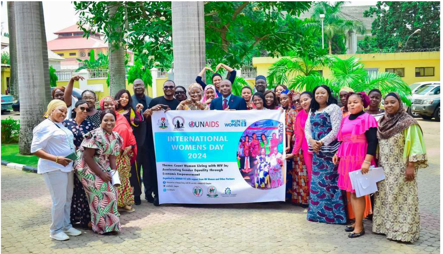
ASWHAN FCT Chapter Commemorates IWD