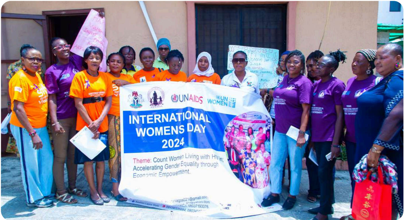
ASWHAN Lagos Chapter